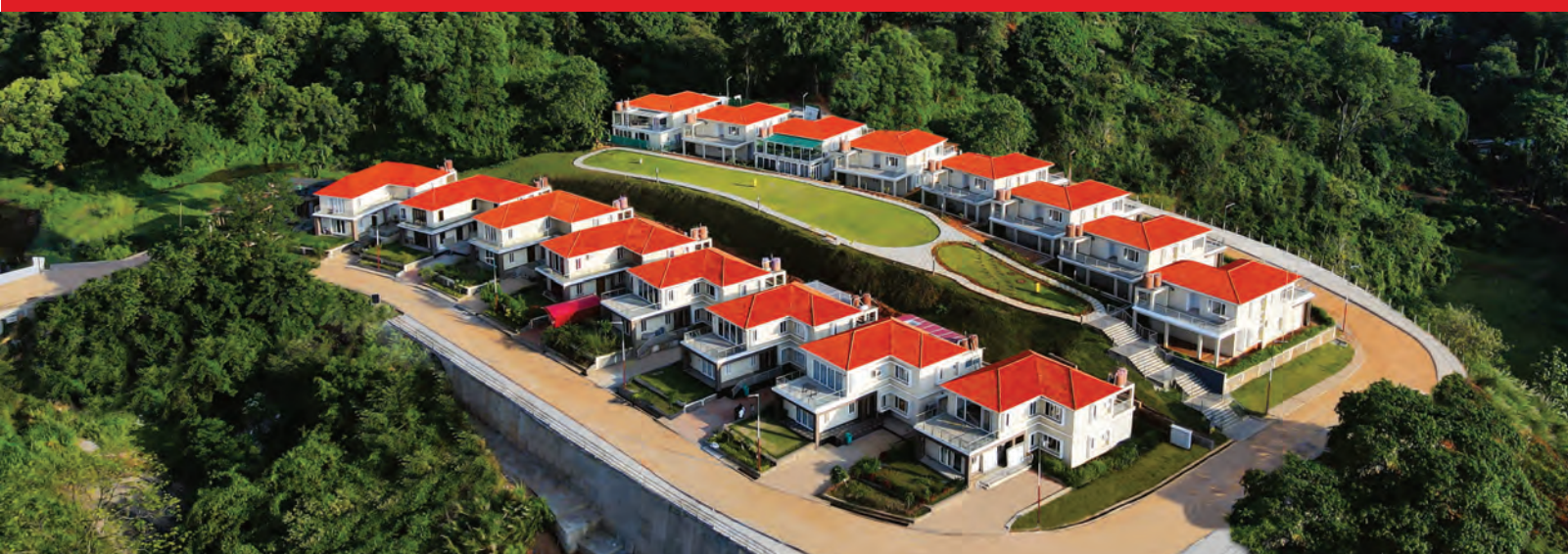
Actual view of the Villas