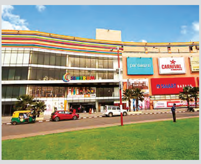
Sentrum Shopping Mall